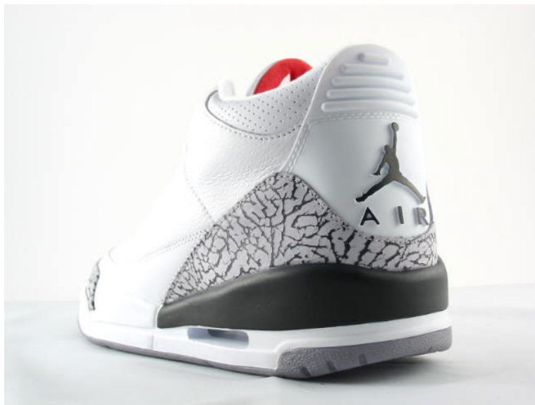
Figure 1: It is more than just a basketball shoe, it is the embodiment of a cultural icon